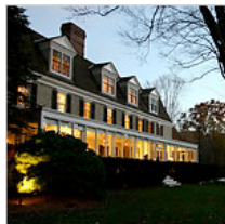
In Litchfield County, a Clash of Titans?