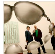
Art and Commerce in Chelsea