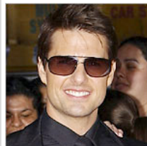
Mission: Rescue Operation