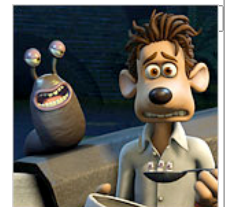
Movie Minutes: 'Flushed Away'